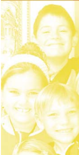
School Spirit Day

Corpus Christi, Marymount Academy, St. Benedict Catholic Secondary School, St. Christopher, St. David, St. Francis, St. James, St. Joseph, St. Michael, St. Theresa